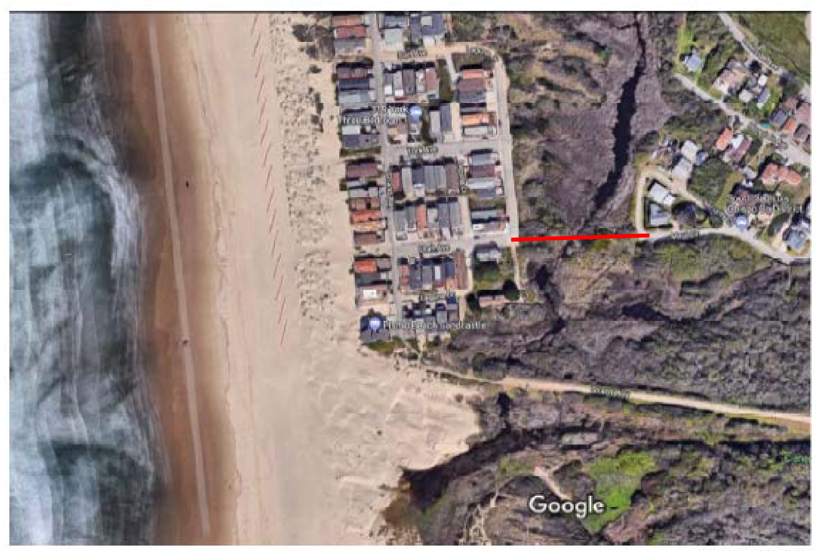
Imagery @2018 Google, Mi