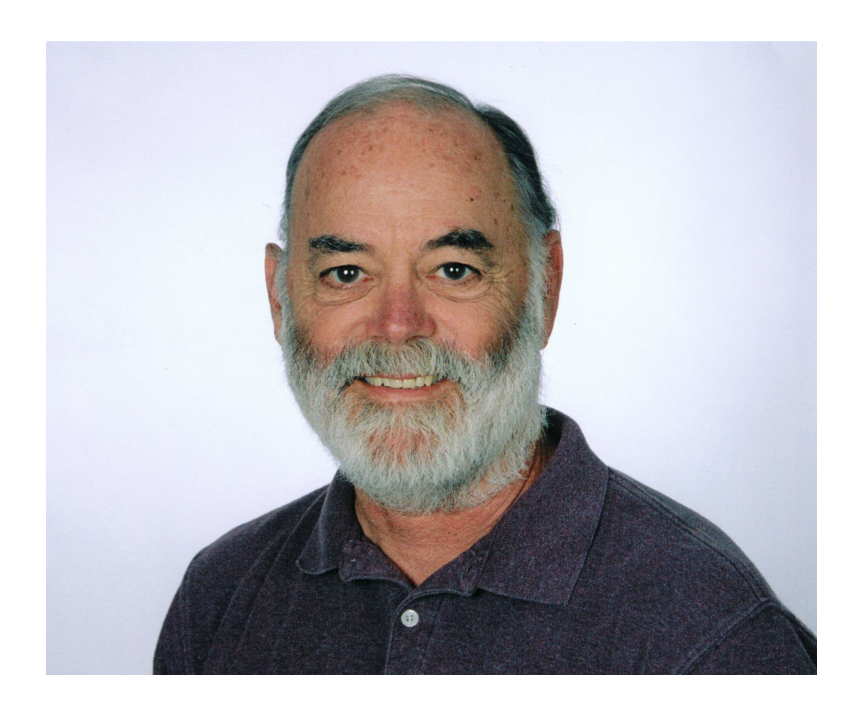
San Luis Obispo County Activities